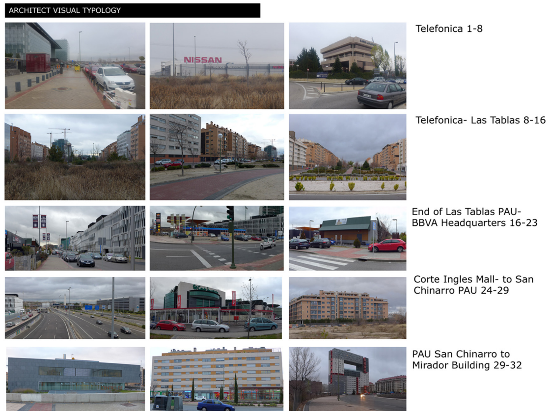
Figure 5 – The visual typology summarise emerging characteristics resulting from fieldwork-architect for Madrid's Northern periphery

see that kind of urbanisation merging with the agricultural land, and in the case of Madrid you can see this land is almost rural, with the ongoing building programme that occurs in the Northern periphery (Figure 4) where we can see this agricultural land mixing with the existing building sites (Figure 5 stages 1-8) where we see the first the new block built in the middle of the rural landscape, or the kind of de-countrified landscape that is present in front of the corporate HQ of Telefonica City. According to Abalos & Herreros this type of landscape represents the “dissolution of the natural-artificial. An opposition that we observe at every scale.” 8 And on this visual typology below we can really see these characteristics.