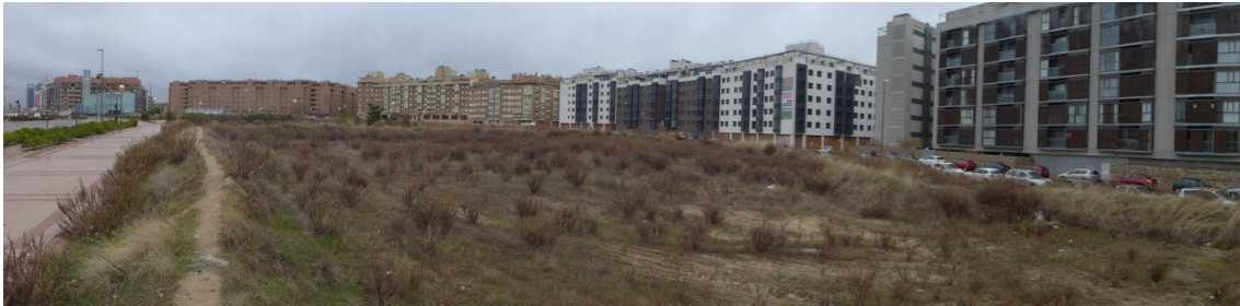
Figure 4- From top to bottom areas of impunity, or empty spaces found in the fieldwork. From top to bottom 1- PAU Las Tablas, this area was open 2-Transition area located at the end of PAU Las Tablas and before PAU San Chinarro, this area was fenced off, but you could enter in certain parts 3. Area at the end of PAU San Chinarro and next to the building Mirador by MVDRV, this area was totally fenced off.