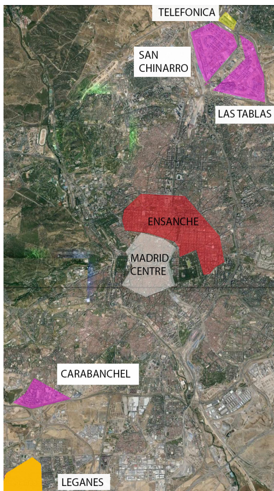
Figure 3 Map showing three different areas of study in the North of Madrid: Telefonica City (in yellow), Las Tablas and San Chinarro (in purple). City Centre (in white), and the Ensanche 19th Century Extension (in red).

feast for the hungry architect, the periphery is dotted with a dozen examples of interesting architectural experimentation." (Prat, 2008: 39). According to Juan Herreros, architects, "[...] view the peripheries as a deregulated zone in which they could rehearse a new scale, typology and programmes, and activate new types of public spaces." (Herreros in Cantis & Jaque, 2009: 285).