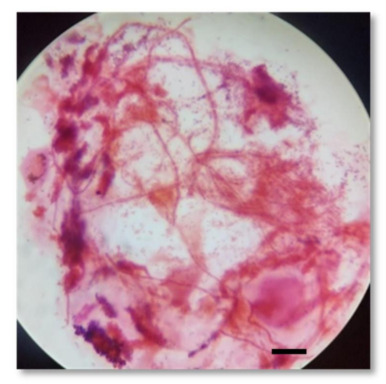
Figure 2. Clusters of epithelial cells with fungal septate hyphae and few neutrophilic granulocytes. Gram staining. Black bar = 20 \mu m .