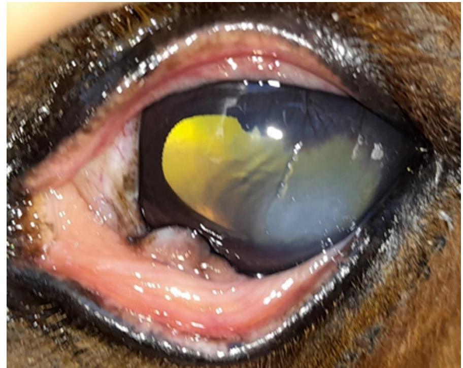
Figure 1. Conjunctival hyperemia, paraxial corneal opacity, covered by a whitish discharge with mild vascular reaction, and mydriasis (due to atropine treatment).

microscopic observation. Removal of the discharge made it possible to see the bottom of the ulcer with the whitish stroma surrounded by oedema. Staining with fluorescein (0.25 % sodium fluorescein, Poen, Argentina) was performed, which revealed an ulcer of 4 mm diameter. After ophthalmological examination, treatment with 0.3 % ciprofloxacin ophthalmic solution (Denver Farma, Argentina) (1 drop every 6 hours) and 1 % atropine (Alcon, Argentina) ophthalmic solution every 24 hours was indicated. Biological material and the 3 smears were sent to the mycology laboratory for analysis.