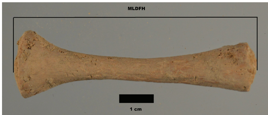
Fig. 2. Maximum length of the diaphysis of the fetal humerus (MLDFH).