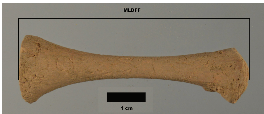
Fig. 1. Maximum length of the diaphysis of the fetal femur (MLDFF).